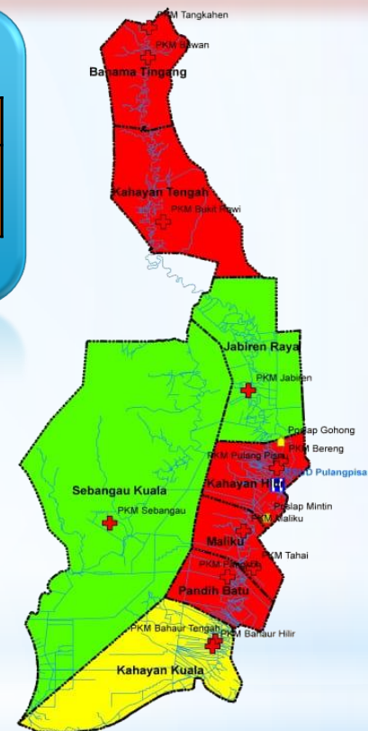
Data Zona Peta Sebaran Kasus Covid – 19 Kabupaten Pulang Pisau Dari Tanggal 17 Maret s/d 16 Mei 2020